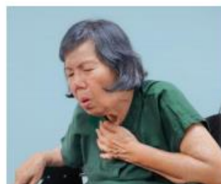
Hard time breathing