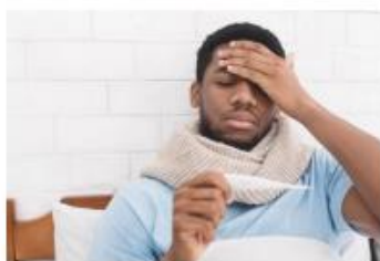
A fever of 100.4° or higher